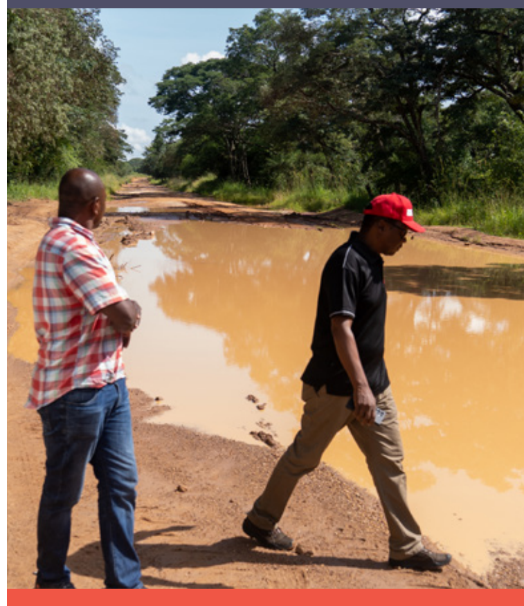
Above, a flooded road on our journey to Chipembi. Below, iDE staff writing notes of thanks to YOU!